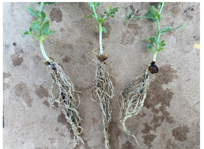
Root rot ratings (L to R): 0= healthy plant, 1= infection at t of seed attachment, 2=5-10% infection

† Severity 0-9 rating scale; Incidence= Percent of plants infected.