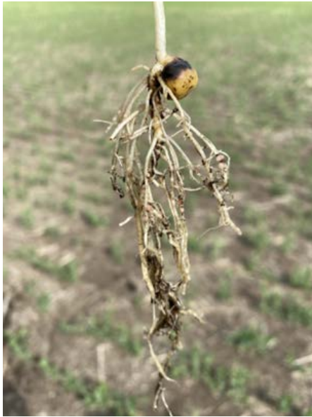
Root rot severity rating 1 = small lesion at point of seed attachment.