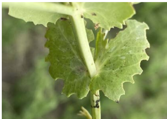
Symptoms of Ascochyta/Mycosphaerella blight at R1 on June 15. Small, dark freckles on lower leaves.

†† Profit is the difference between the change in income/ac from a significant yield difference, and the range in cost/ac of the fungicide