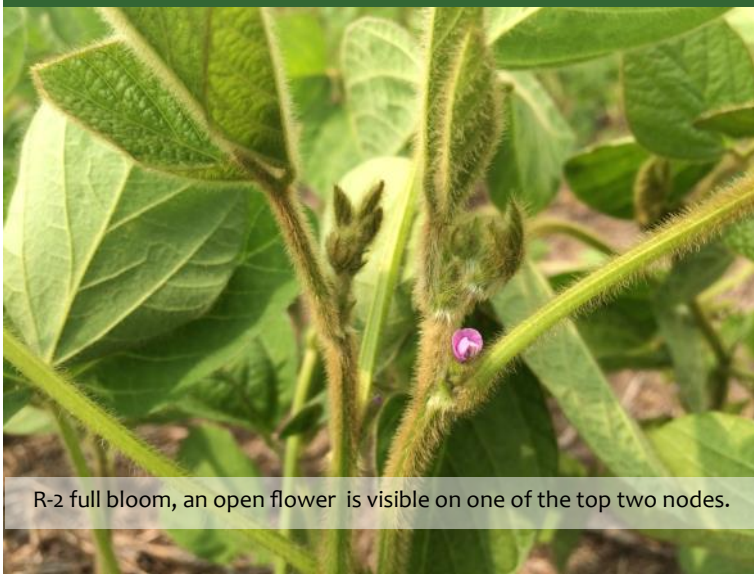
R-2 full bloom, an open flower is visible on one of the top two nodes.